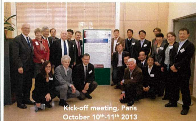
Kick-off meeting, Paris October 10 th -11 th 2013