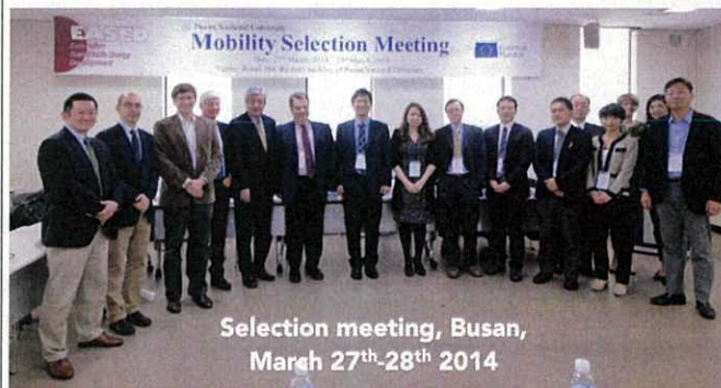
Selection meeting, Busan, March 27 th -28 th 2014