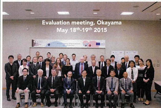
Evaluation meeting, Okayama May 18 th -19 th 2015